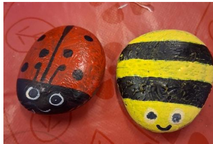
Anabel's class are busy creating an indoor garden to be displayed on the mantelpiece in their room. We think they look lovely!