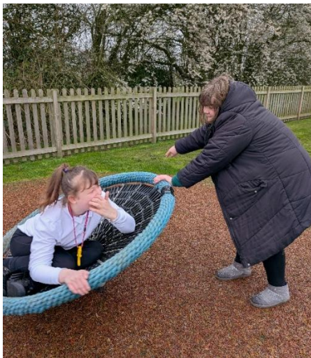
Caroline's class had a fun time at Pickering play park before breaking up for Easter.