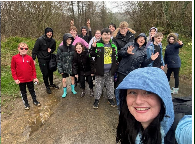
At the end of term Lower and Upper Nurture went on a walk to Kirkdale!!! They had a fantastic time exploring the woods and countryside near our school.