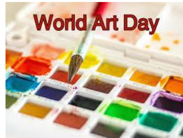
Emma's class also got their creative juices flowing for World Art Day.